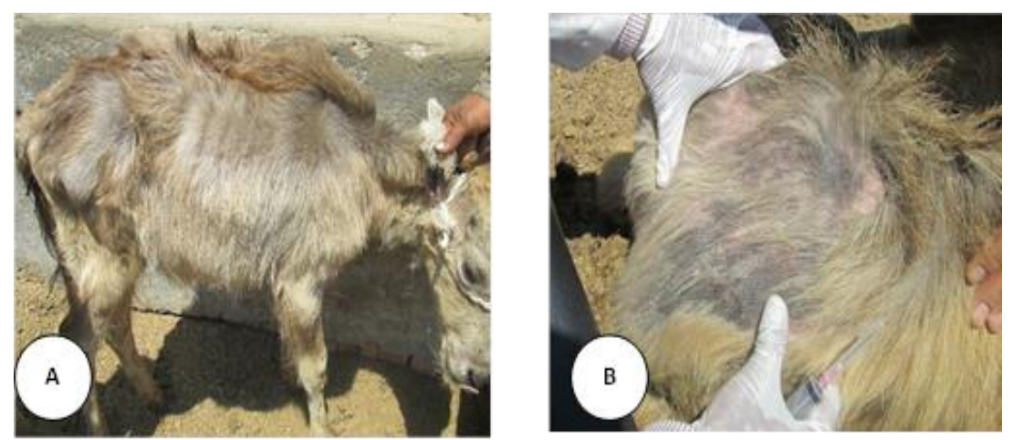
Fig (2) A diarrheic buffalo calf showing signs of severe emaciation, rough coat (A) and signs of alopecia (B).