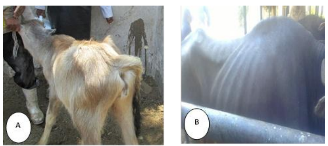
Fig (1) Adiarrheic buffalo calf (A) and Adiarrheic adult buffalo (B) showing signs of emaciation and reluctance to move.